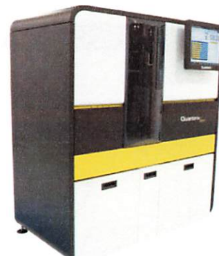
Data below represents results generated on the Simoa™ HD-X Analyzer.