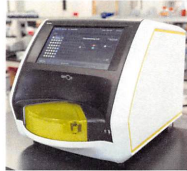
Data below represents results generated on the Quanterix SR-X™ Ultra-Sensitive