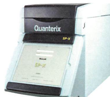
Data below represents results generated on the SP-X Imaging and Analysis System