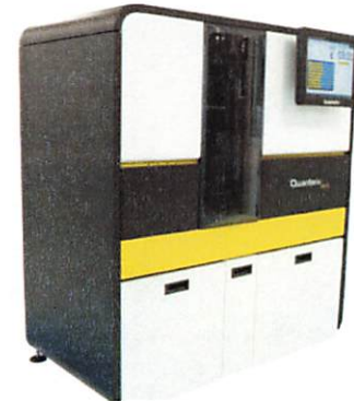
Data below represents results generated on the Simoa™ HD-X Analyzer.