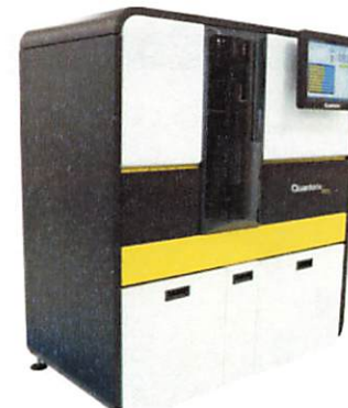
Data below represents results generated on the Simoa™ HD-X Analyzer.