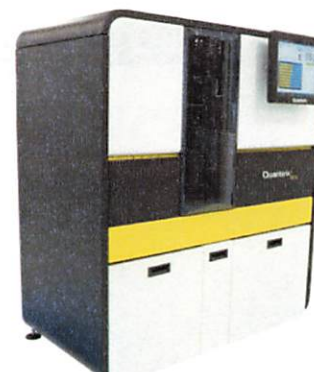
Data below represents results generated on the Simoa™ HD-X Analyzer.