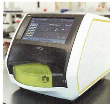
Data below represents results generated on the Quanterix SR-X™ Ultra-Sensitive