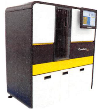
Data below represents results generated on the Simoa™ HD-X Analyzer.