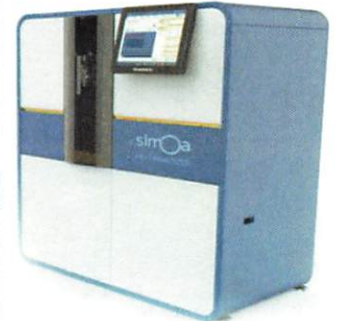
Data below represents results generated on the