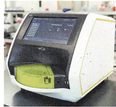
Data below represents results generated on the Quanterix SR-X™ Ultra-Sensitive