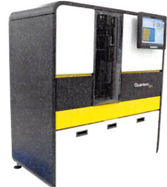
Data below represents results generated on the Simoa™ HD-X Analyzer.