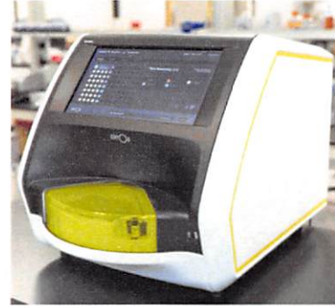
Data below represents results generated on the Quanterix SR-X™ Ultra-Sensitive