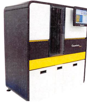
Data below represents results generated on the Simoa HD-X® Analyzer.