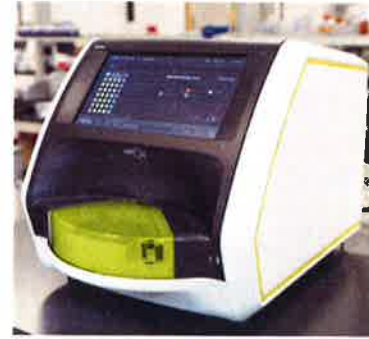
Data below represents results generated on the Quanterix SR-X™ Ultra-Sensitive