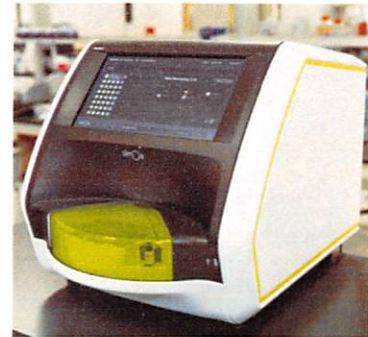
Data below represents results generated on the Quanterix SR-X™ Ultra-Sensitive