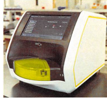
Data below represents results generated on the Quanterix SR-X™ Ultra-Sensitive