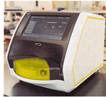
Data below represents results generated on the Quanterix SR-X™ Ultra-Sensitive