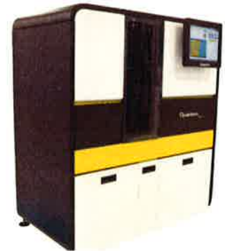
Data below represents results generated on the Simoa™ HD-X Analyzer.