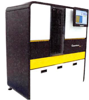
Data below represents results generated on the Simoa™ HD-X Analyzer.