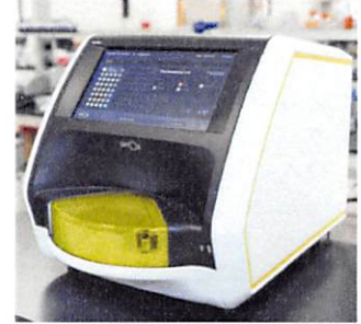
Data below represents results generated on the Quanterix SR-X™ Ultra-Sensitive Biomarker Detection System