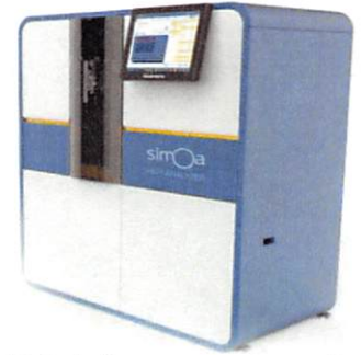
Data below represents results generated on the Simoa™ HD-1