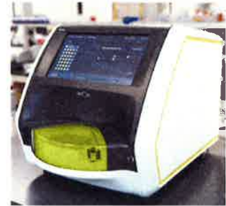
Data below represents results generated on the Quanterix SR-X™ Ultra-Sensitive Biomarker Detection System