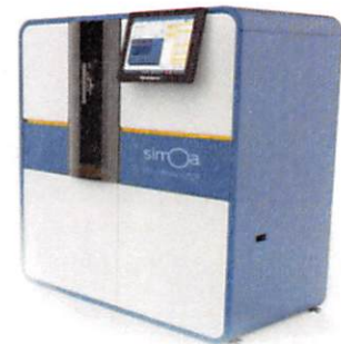
Data below represents results generated on the Simoa™ HD-1