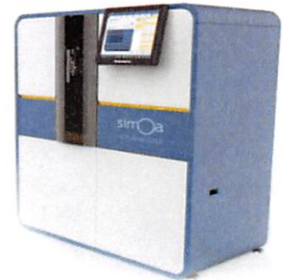
Data below represents results generated on the Simoa™ HD-1