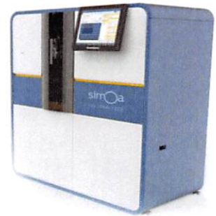
Data below represents results generated on the Simoa™ HD-1