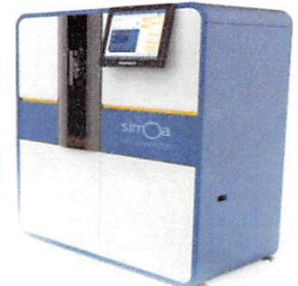
Data below represents results generated on the