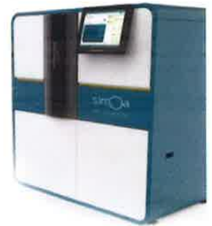
Data below represents results generated on the