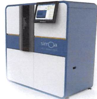
Data below represents results generated on the Simoa™ HD-1 Analyzer.