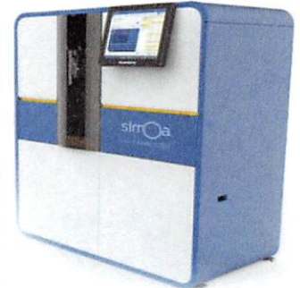
Data below represents results generated on the