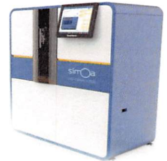
Data below represents results generated on the Simoa™ HD-1