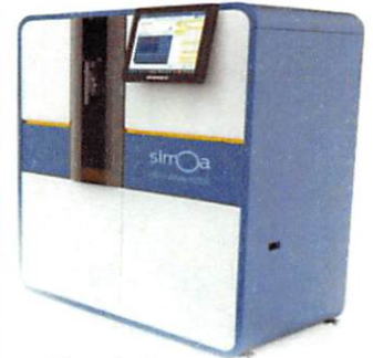
Data below represents results generated on the Simoa™ HD-1 Analyzer.