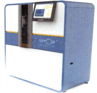
Data below represents results generated on the Simoa™ HD-1 Analyzer.