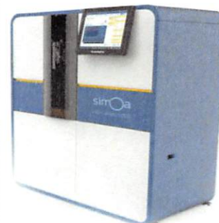
Data below represents results generated on the Simoa™ HD-1 Analyzer.