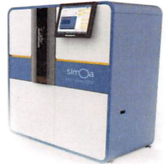
Data below represents results generated on the Simoa™ HD-1