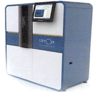
Data below represents results generated on the Simoa™ HD-1