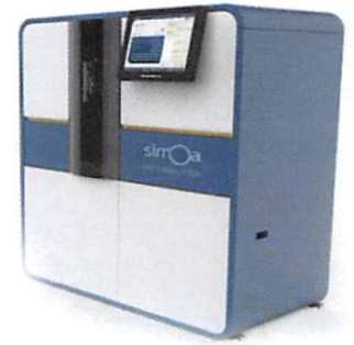
Data below represents results generated on the Simoa™ HD-1