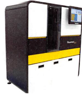
Data below represents results generated on the Simoa™ HD-X Analyzer.