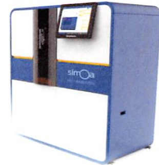
Data below represents results generated on the Simoa™ HD-1 Analyzer.

Product Number: 101580 Lot Number: 501639 Expiration: 29-Jan-2020 Platform(s): HD-1 & SR-X