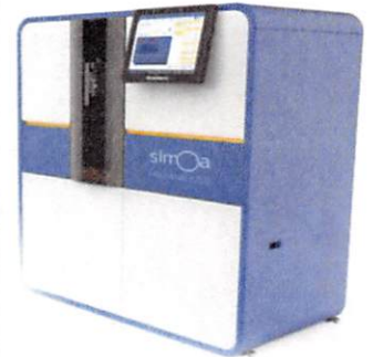
Data below represents results generated on the Simoa™ HD-1 Analyzer.