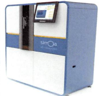
Data below represents results generated on the