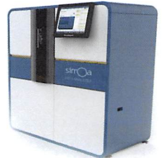
Data below represents results generated on the Simoa™ HD-1