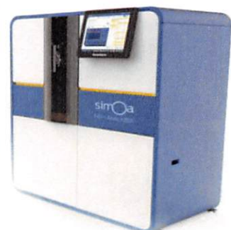
Data below represents results generated on the