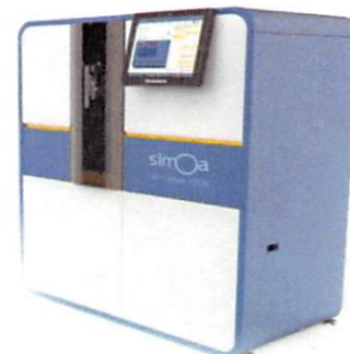
Data below represents results generated on the