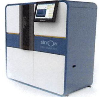
Data below represents results generated on the Simoa™ HD-1