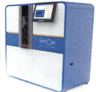
Data below represents results generated on the