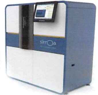
Data below represents results generated on the