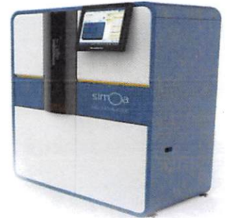
Data below represents results generated on the Simoa™ HD-1