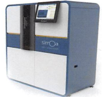
Data below represents results generated on the Simoa™ HD-1