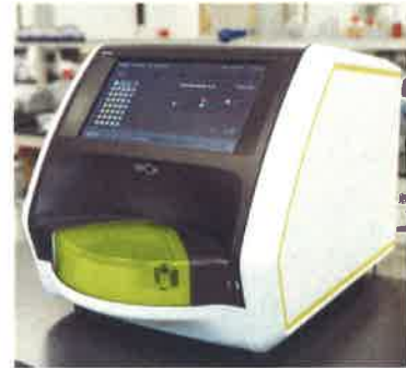
Data below represents results generated on the Quanterix SR-X™ Ultra-Sensitive