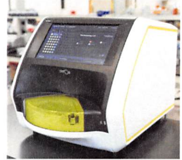
Data below represents results generated on the Quanterix SR-X™ Ultra-Sensitive Biomarker Detection System